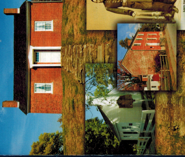
LEFT: GEN. GRANT.